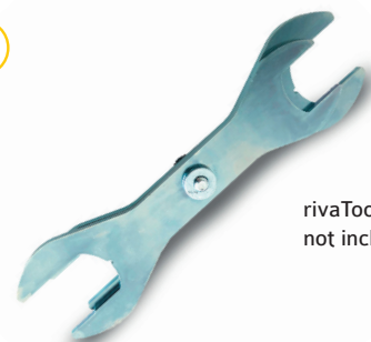
rivaTool All-in-one, not included in delivery